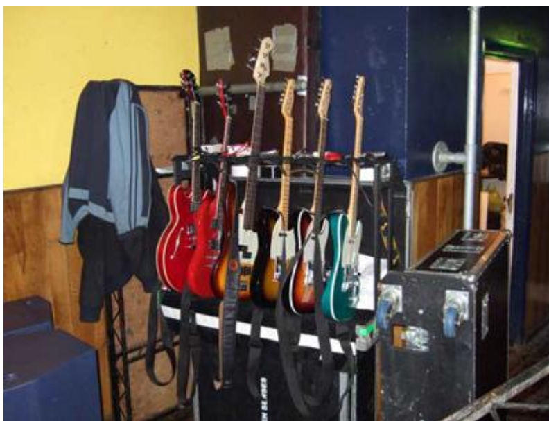
This is known to us as 'Guitar World', probably because of all the guitars