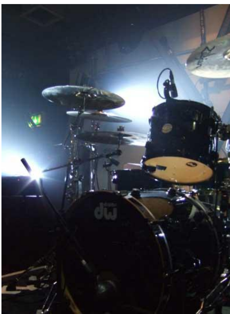
Drums - cool!