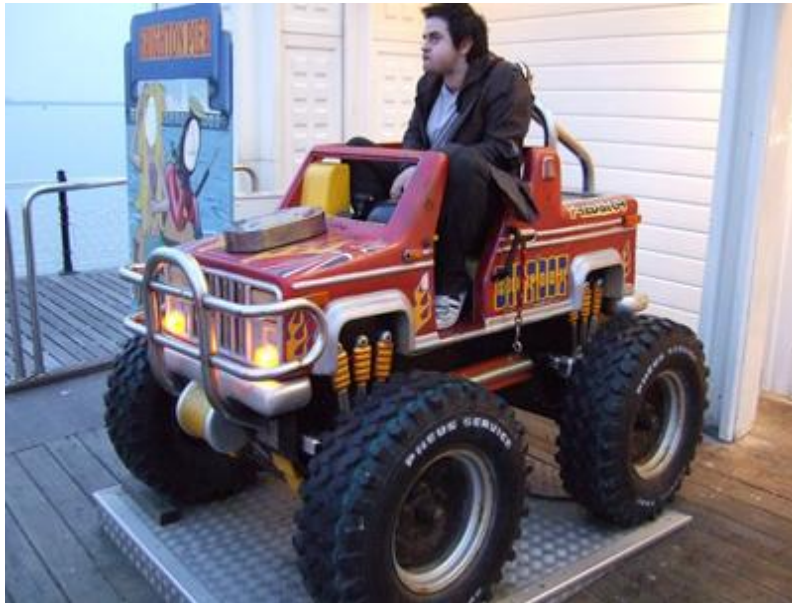
"Outta my way!!!"