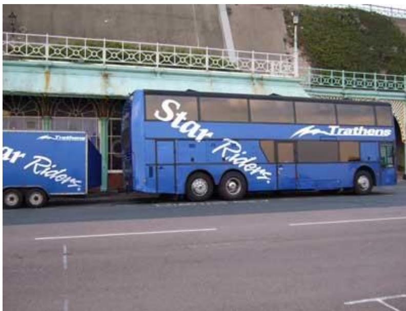
Brighton, luckily parked a full 15 metres from the entrance to the gig!