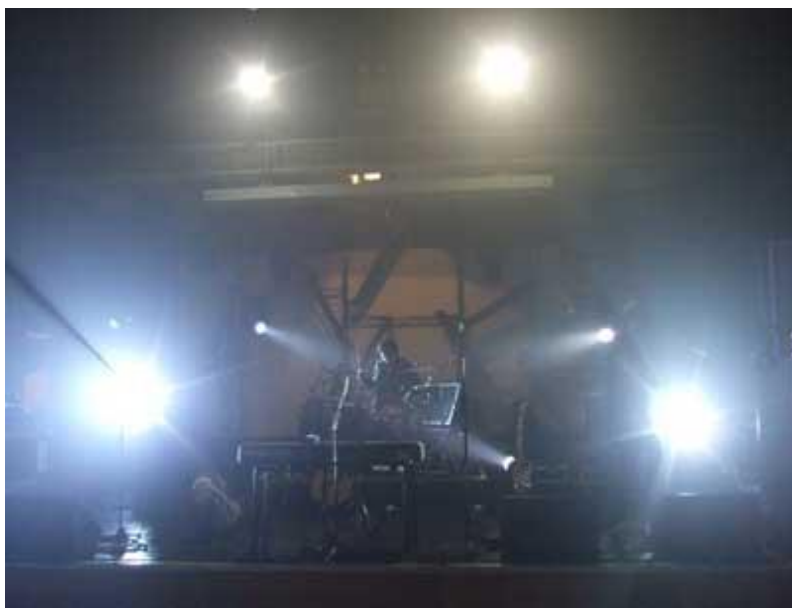
Lots and lots of lights!