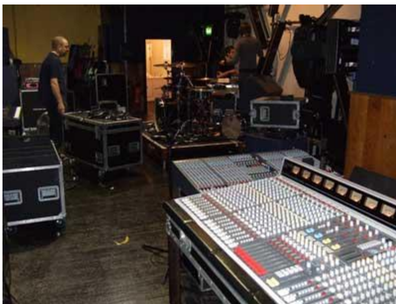
The tour rolls into London, at The Scala