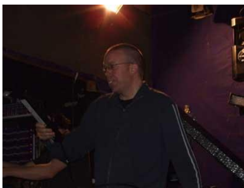
Backline tech Noddy