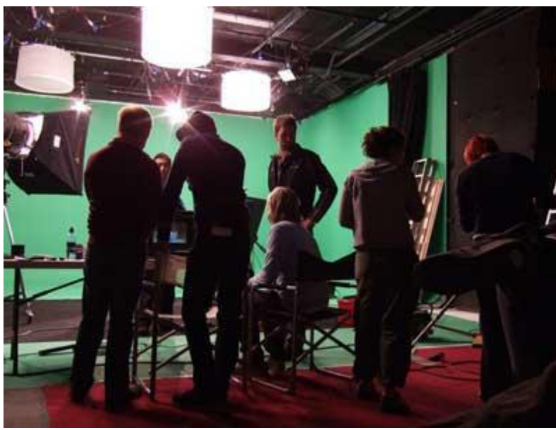
Green screen! Special FX! Oh yeah!!