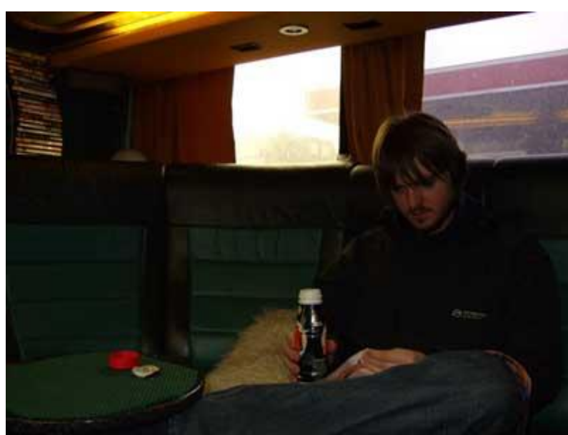
Bren, a chocolate milkshake, and an unbreakable stare