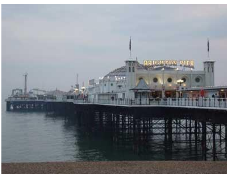
Can you tell what it is yet?